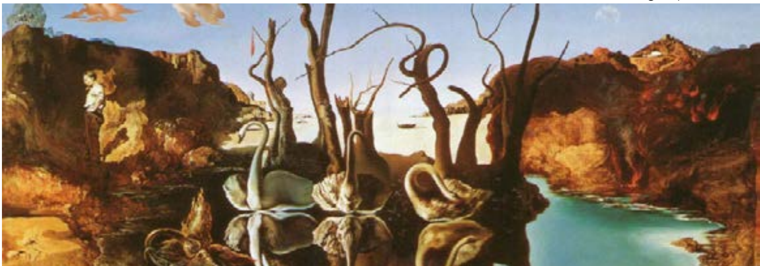
Salvador Dali - Swans Reflecting Elephants, 1937

We are proud to announce that this year, THREE winning artists will gain access to six week residencies in the Provence region, Southern France . Previous recipients of the Chippendale World Art Residency have honed their skills in Beijing, Assisi in Italy, Marcia in Spain and Kefalonia, Greece.