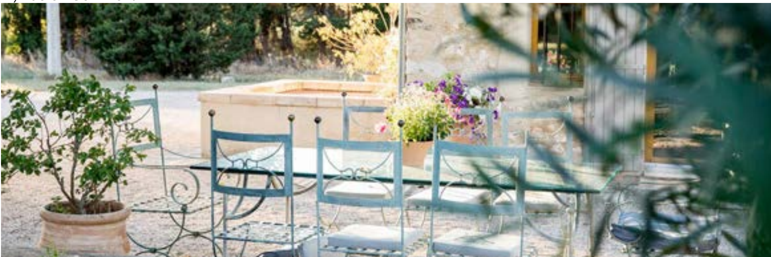
Les Mas des Pelerins - NG Art Creative Residency By Lauren Commens