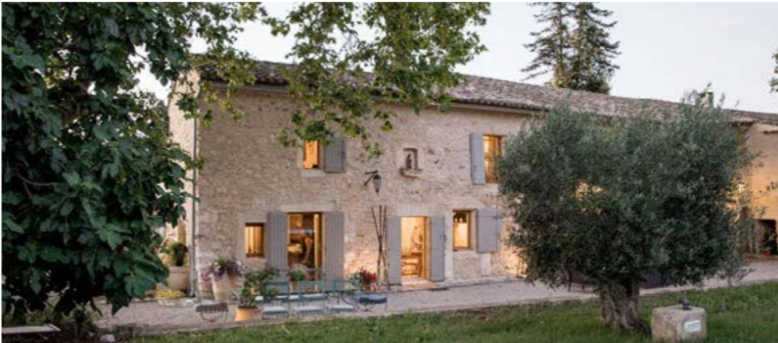
Les Mas des Pelerins - NG Art Creative Residency

This residency is your golden opportunity for creative growth in a setting of ultimate French Provencal luxury. The region's beauty has inspired the likes of Van Gogh, Cezanne, Monet, Renoir, Picasso, Matisse and countless others, now let it inspire you!